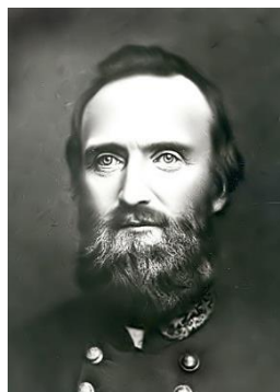
General Stonewall Jackson