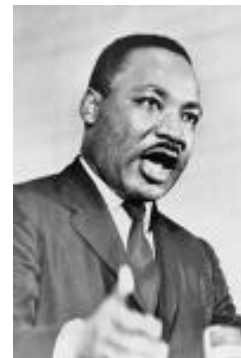
Rev. Martin Luther King, Jr.

The Town offices will be closed on Friday, January 13, 2017, in observance of Lee-Jackson Day, and Monday, January 16, 2017, in observance of Martin Luther King, Jr. Day.